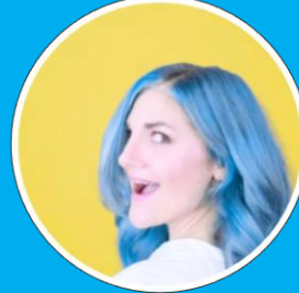
Casie Lane Creative / Media